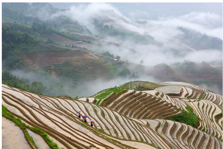
Guling Rice Terrace