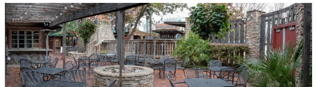
Ozona Bar and Grill Friday Night's venue for Cinco De Mayo