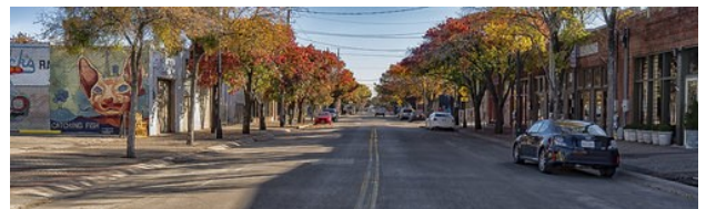
Deep Ellum street for Street Photography on Saturday