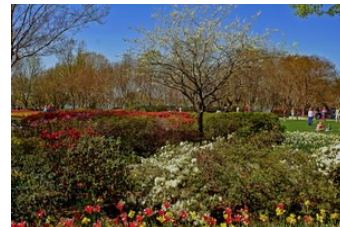
Dallas Arboretum for Friday Morning Field

There will also be opportunities for night shooting of the bright lights of Dallas.