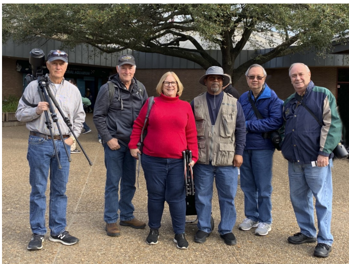
The February Field Trippers

The competition and critique meeting will be 7:00 PM March 12 at Tracy Gee Community Center, 3599 Westcenter Drive, which is one block inside Beltway 8 between Westpark and Richmond.