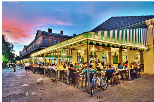
Café Du Monde New Orleans

The meeting will be held at the Springhill Suites convention Center in downtown New Orleans. Get all the details at: www.gulfstatesccc.org/convention2020