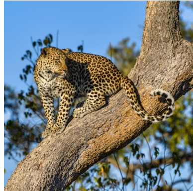
First Place Watching Antelope by Joe Schmitt