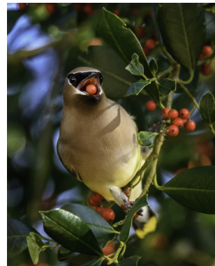
Second Place Cedar Waxwing by Joe Schmitt