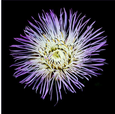
First Place Lavender by Tim Bimler