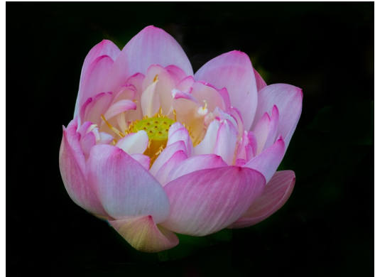
First Place Lotus Flower by Philip tan