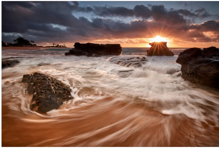
First Place A Beautiful Day Begins by Julie Cheng