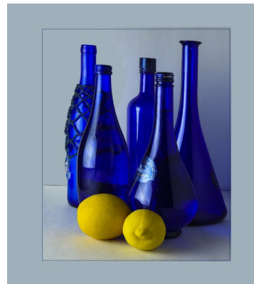
Second Place Cobalt Study by Carmen Sewell