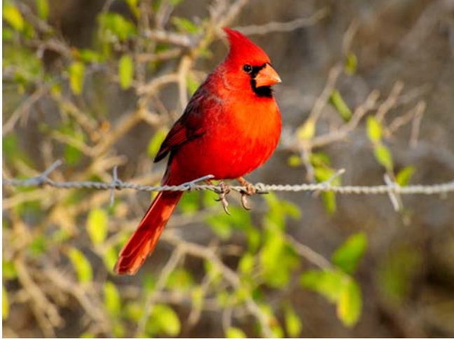
Above left: Male Cardinal