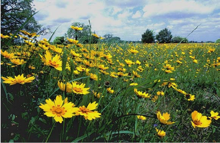
Top Left: First Place, "Yellow Daisies" by Cliff Segerstrom