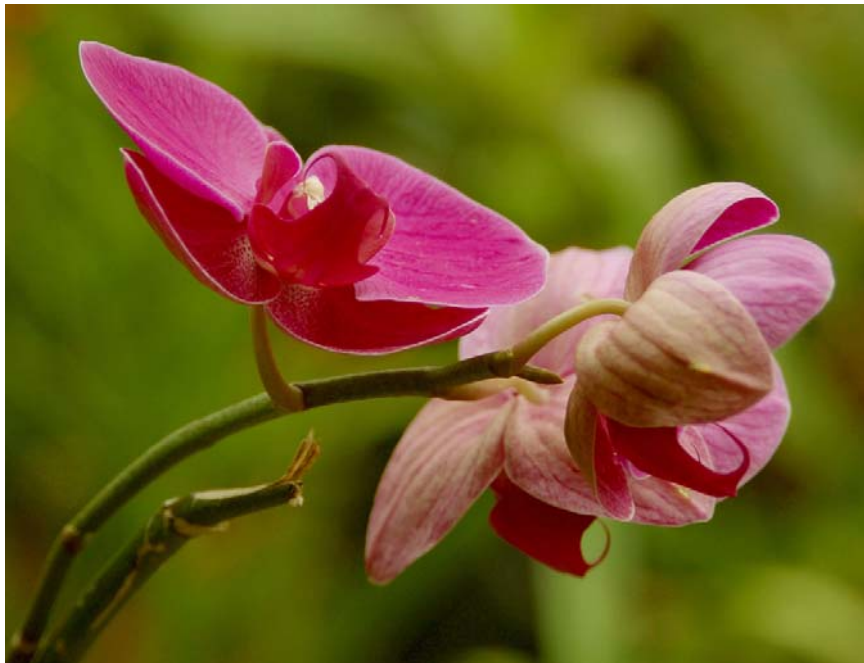
Below: Lolita's Orchid by Ninfa Palazzolo

Each month Reflex News will publish some of our members favorite shots in the Members Showcase. Requirements for submission are found on page 7 of this issue.