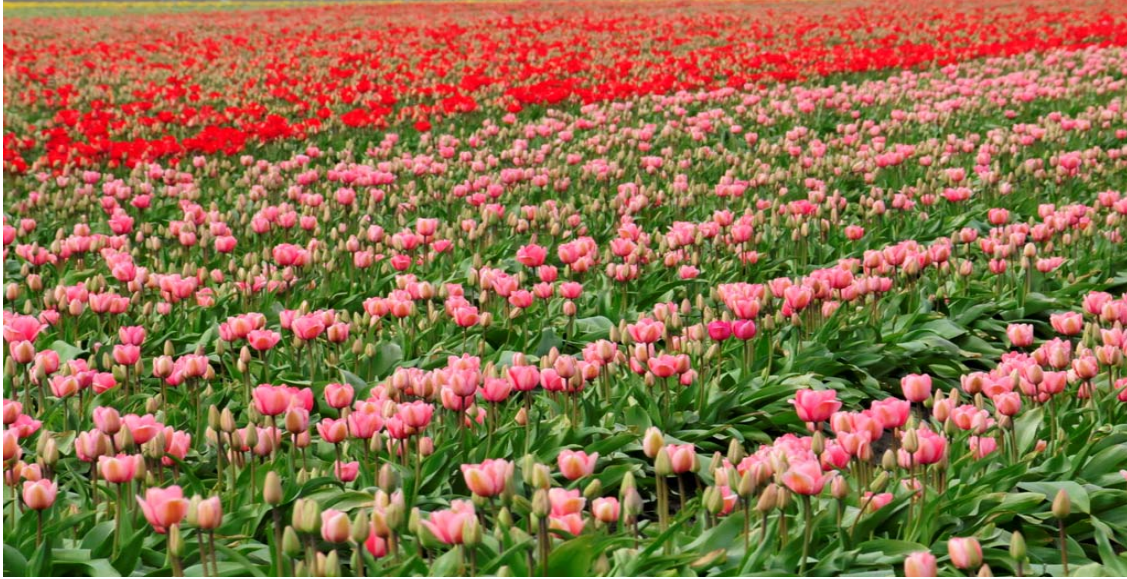
Above: Tulip Fields, Skagit Valley WA