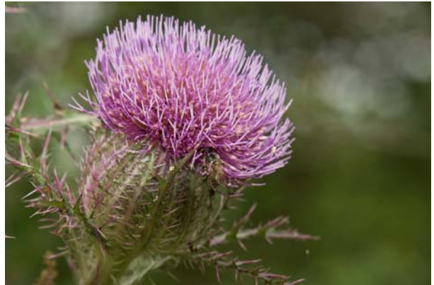
Field trip

On our last field trip to High Island, it was the Burychkas, John Breaux, Eric Westling and myself. In addition to the egrets, ibises and the roseate spoonbills on the island, the flock of cattle egrets across the pond, there were also lots of gators. And, there were also a lot of song birds on the observation platform side of the pond. Bill was trying to get some indigo bunting that was flitting around the bushes. There were also some macro opportunities in the wild flowers growing there