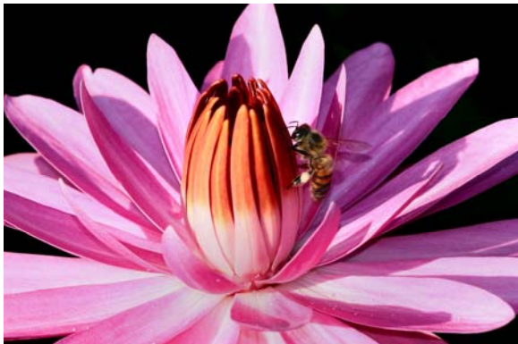
Waterlily, Nelson Watergardens