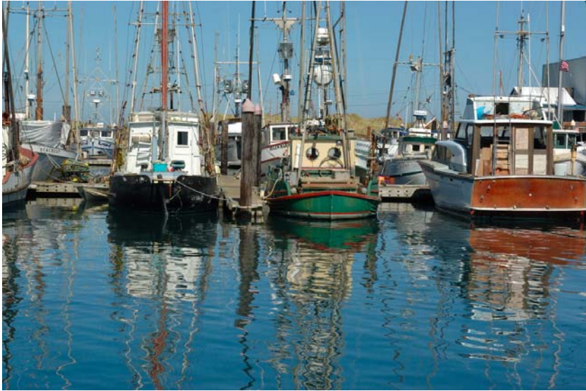
Above: Harbour Reflections Above Right :Oak Dog Sculptur Below Green Frog on Bud