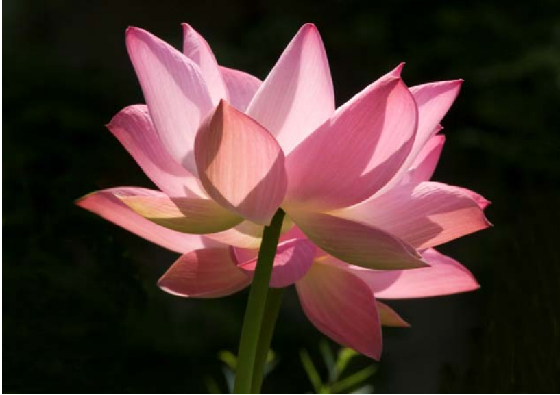
Top: Lotus Flower By Philip Tan