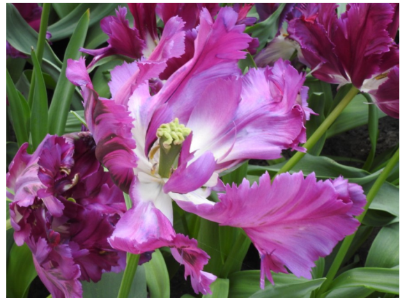
From above to below

Carmen will demonstrate some of these techniques and show how they were used to salvage some almost “throw -a -ways” to high scoring images.